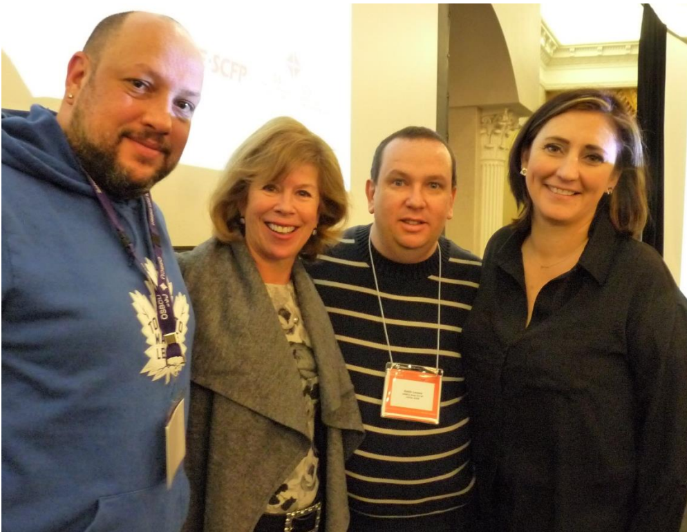
... and Niagara Nutrition Partners, recipient of OSBCU convention fundraising efforts.