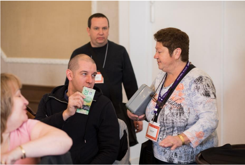
Enthusiasm and persistence from ticket sellers for the 50-50 draw...